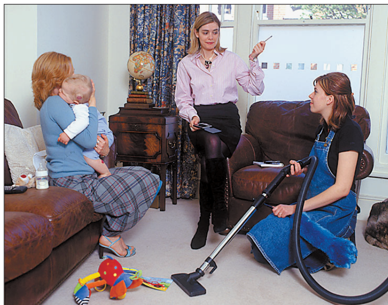
Under control: a lifestyle manager discusses the day's work with the nanny and housekeeper